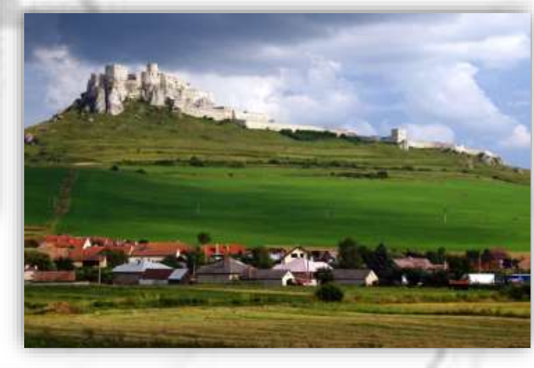
Beauty of SLOVAKIA