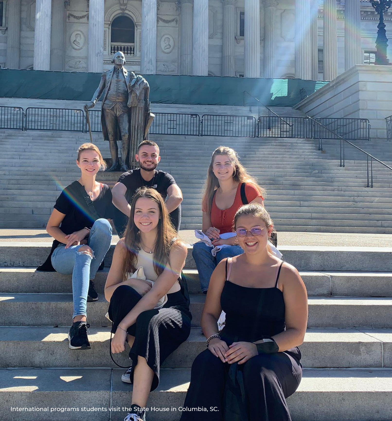
International programs students visit the State House in Columbia, SC.

“Travel,” wrote Euripides, _____ _____ “is an education unto itself.””