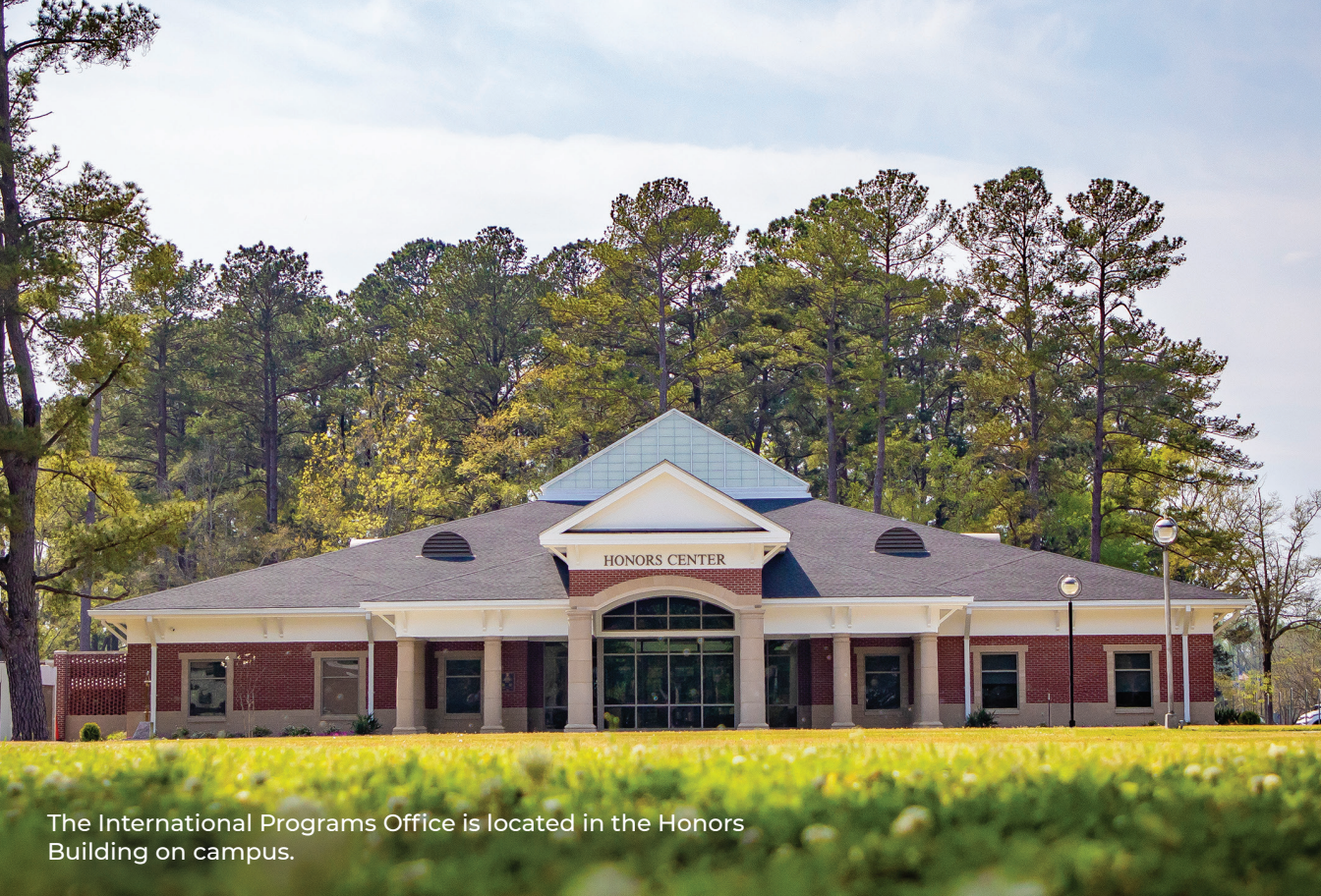
The International Programs Office is located in the Honors Building on campus.